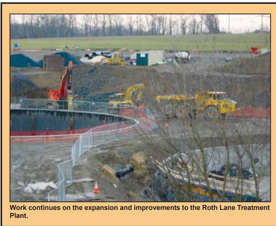
Work continues on the expansion and improvements to the Roth Lane Treatment Plant.

The improvements include a new administration building, the upgrading of several pumping stations and the expansion, modernizing and renovating of the Roth Lane plant to remove nitrates and phosphates from the Chesapeake Bay watershed. As improvements continue, the Township is planning to close the Pinebrook Treatment Plant later this year.